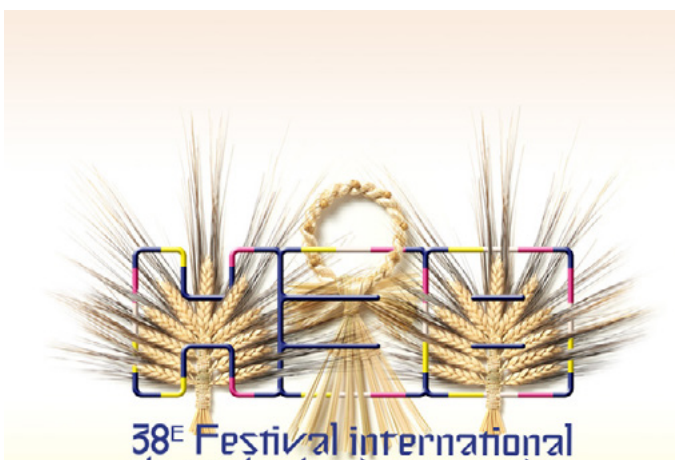
38<sup>E</sup> Festival international de mode, de photographie et d'accessoires - Hyères

The partnership between the Alliance for European Flax-Linen & Hemp and the International Festival of Fashion, Photography and Fashion Accessories, Hyères, aims to facilitate access to textile and technical innovations in European Flax-Linen for finalists in the fashion and accessories contests.